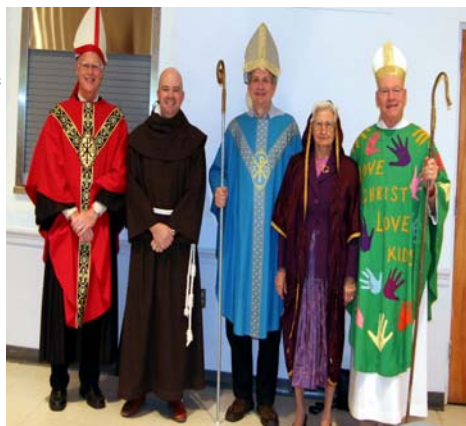
Our Saints on All Saint's day Becket, Francis, Dunstan, Margaret & Patrick

After the saints told their stories, the children made lanyards with beads representing each saint.